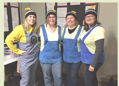
Curlers at the 11th Annual Bonspiel